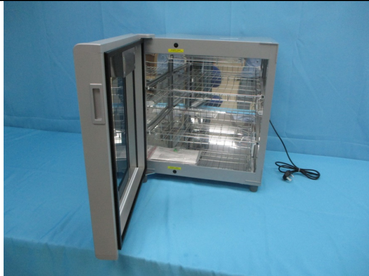
UVC Disinfection Chamber (model: UVCC200 80W) as Received

This document is issued by the Company under its General Conditions of Service printed overleaf or available on request and accessible at http://www.sgs.com/terms_and_conditions.htm . Attention is drawn to the limitation of liability, indemnification and jurisdiction issues defined therein. Any holder of this document is advised that information contained hereon reflects the Company's findings at the time of its intervention only and within the limits of Client's instructions, if any. The Company's sole responsibility is to its Client and this document does not exonerate parties to a transaction from exercising all their rights and obligations under the transaction documents. Any unauthorized alteration, forgery or falsification of the content or appearance of this document is unlawful and offenders may be prosecuted to the fullest extent of the law."