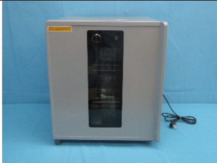
UVC Disinfection Chamber (model: UVCC200 80W) as Received